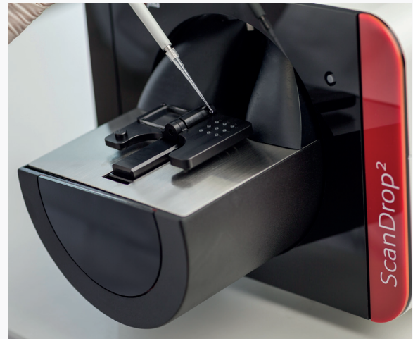
Fig. 2: Filling the Butterfly Cuvette